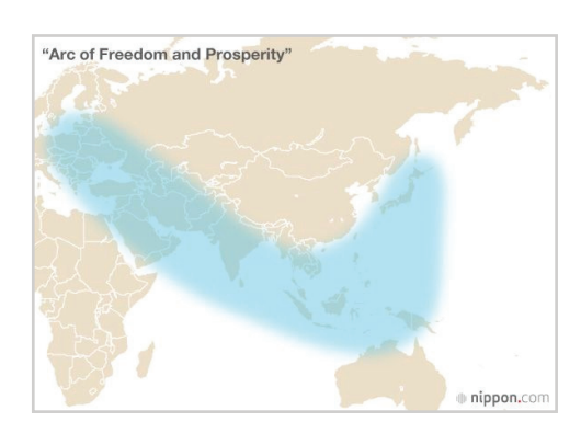
Figure 02: An Overall View of the Arc.

On the other hand, the strategy is not brand new but an updated version of the former "Arc of Freedom and Prosperity" championed by Prime Minister Taro Aso in 2006 onwards. Although the Project was left aside within a few years, it had provided the MOFA with an expanded vision. If it could be realized, "the Arc would start from Northern Europe and traverse the Baltic states, Central and South Eastern Europe, Central Asia and the Caucasus, the